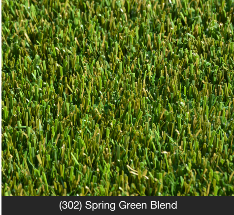
(302) Spring Green Blend